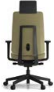
K50A (BK) K50A-BS (WH)