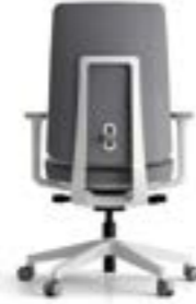
K50B (BK) K50B-BS (WH)