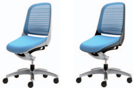
Frame Color : White