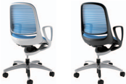
Frame Color : White